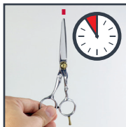
Blades hardly overlap completely: false