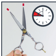
Blades hardly overlap at all: false