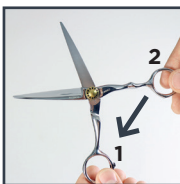
Blade mobility test

Ideally wet the pivot point with a drop of scissor oil every day, so that operation and cutting remain good in the long-term.